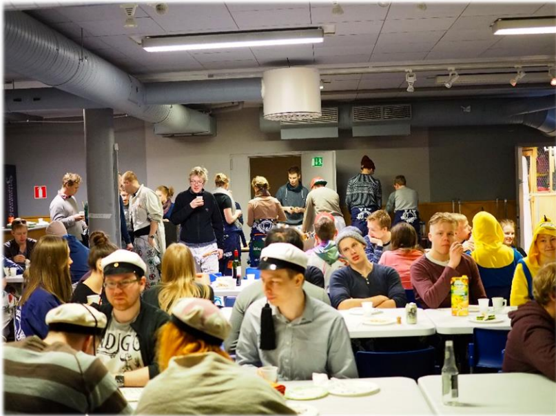
Energiateekkaripäivät 2016, in Lappeenranta

During march, the yearly "energiateekkaripäivät" (energy technology student days) are held either in Lappeenranta, Espoo or Tampere. The event consists of seminars held by energy technology firms, sitz party after the seminar and "sillis" (=curing hangover event) on the following morning. We usually combine the longer excursion to this event if it is held outside Lappeenranta. If the event is held at Lappeenranta, we will have a shorter excursion later in the spring.