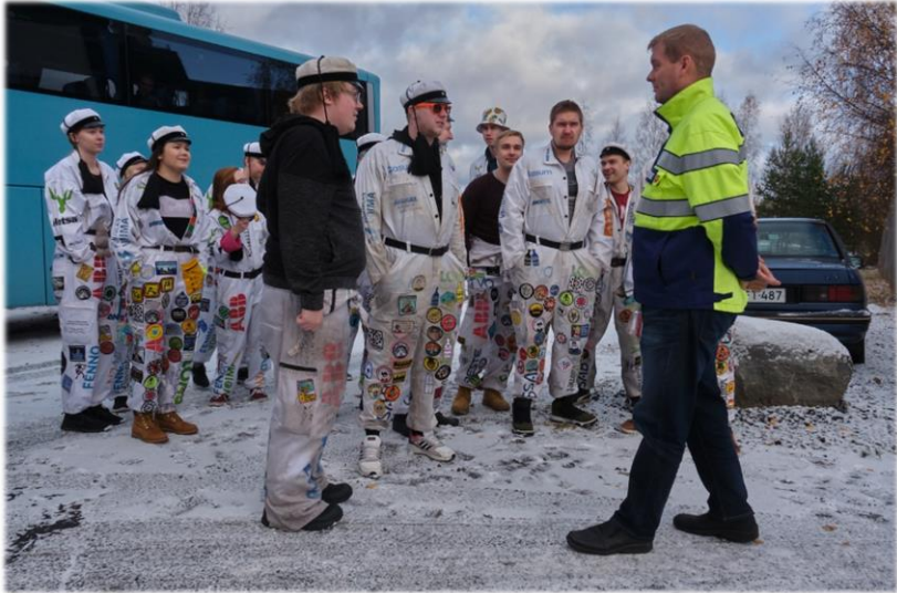
Freshman excursion 2019, visiting Etelä-Savon Energia

Excursion is a bus trip of one to three days with the purpose of visiting energy field's companies and other energy technology students across Finland.