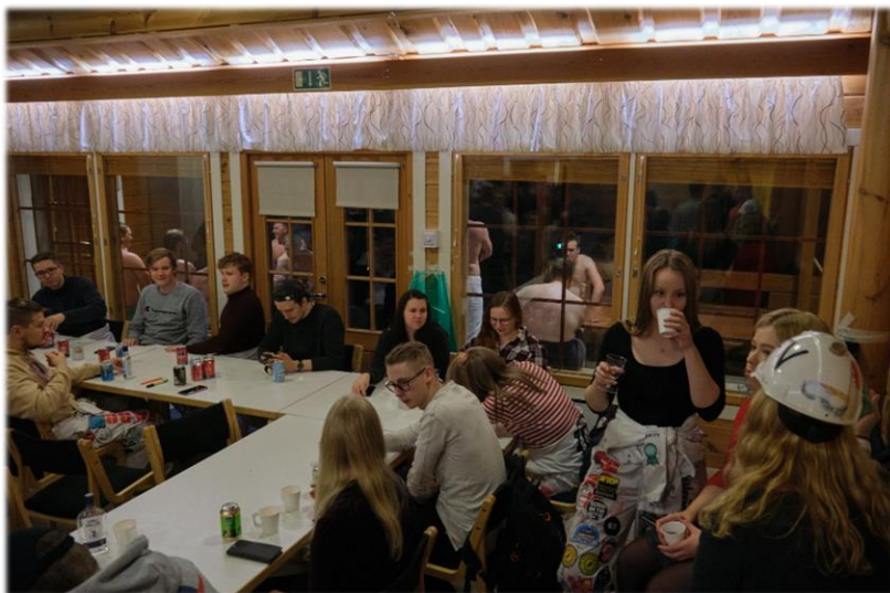
Pre-Christmas party 2019

At the end of each year there is a general assembly of the guild, where we choose a new chair and a board for the guild. After the assembly comes guild's pre-Christmas party where porridge along with glögi is served. Sauna is also warm.