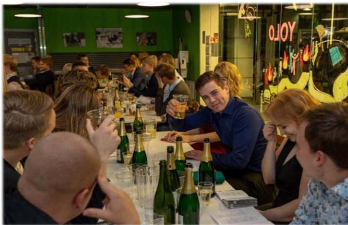
Freshman sitz 2020

Sits are briefly an academic table party. In practice, the way has landed in Sweden and is somewhat reminiscent of crab festivals but has evolved over the years to be slightly different in each locality. Squatting includes singing, squeaking drinks, dressing according to the theme, food and, of course, sequels.