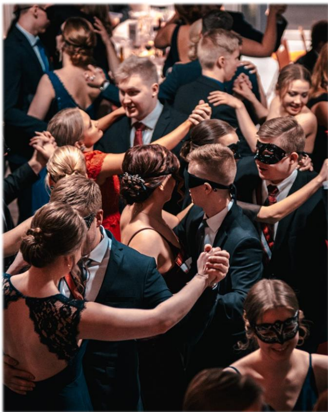
Armatuuri's 46. annual ball on spring of 2020

During the winter we hold the guild's annual ball. This is the most prestigious celebration of the year. Representatives from other guilds around Finland come and celebrate with us. In this party we shall drink, eat well and dance.