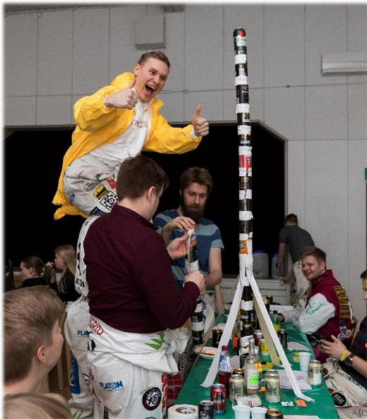
Finland's most radioactive sitz party 2020